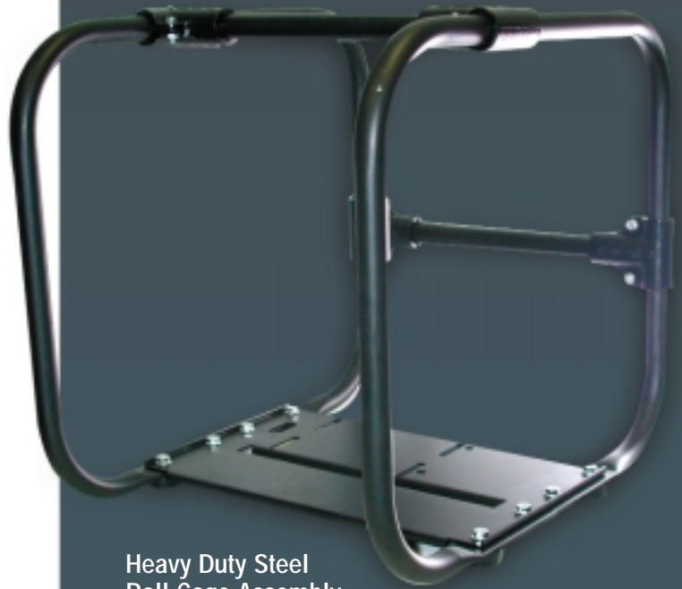
Heavy Duty Steel Roll Cage Assembly