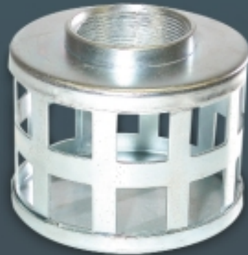
Trash Type Suction Strainer with Large Openings