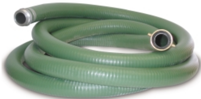
PVC Reinforced Suction Hose