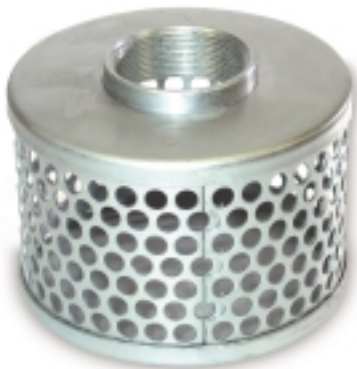
Standard Suction Strainer with Small Openings